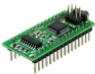
NanoCore12DXC32S Module, RS232 Interface, 32-pin USD $49.00

9S12C32 MCU module in 24-pin DIP form-factor, RS232 interface [Product Details...]