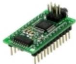
NanoCore12C32S Module, RS232 Interface, 24-pin USD $49.00

9S12C32 MCU module in 24-pin DIP form-factor, RS232 interface [Product Details...]