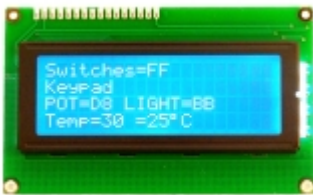
LCD, 20 char. x 4 lines, blue with white LED backlight USD $15.00

Basic low-cost 16-character 4-line display. [Product Details...]