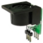
DIN Adapter, top-entry 5-pin (for AT-style keyboard, etc.) USD $7.00

Data sheet for Din and Mini-Din adapters is available here