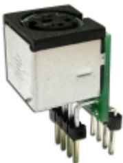
Mini-DIN Adapter, 6-pin (for PS/2 keyboard, mouse, etc.) USD $6.00